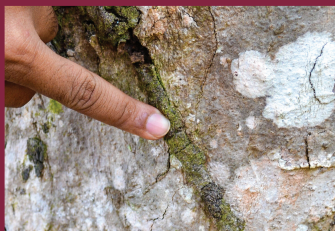
Mud track of Arboreal termites