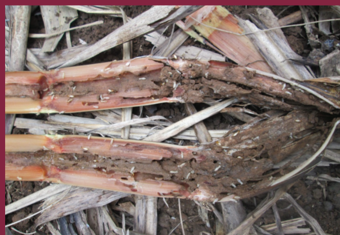
Termite impact on sugarcane