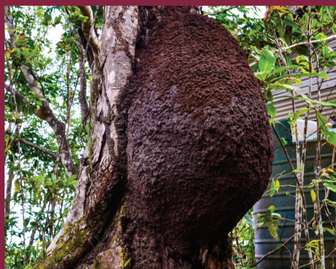
Arboreal termite nest Nasutitermes sp.